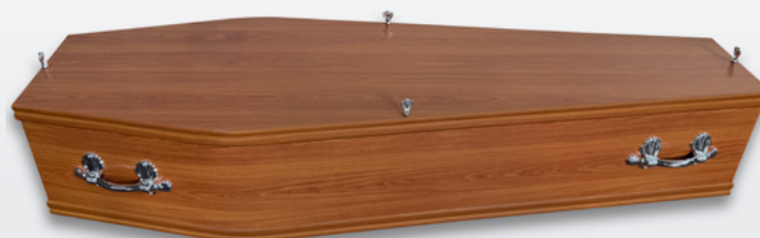
Wood effect coffin featuring flat lid and sides

We are here for you 24 hours a day 365 days a year